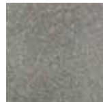
French Gray C5-T7